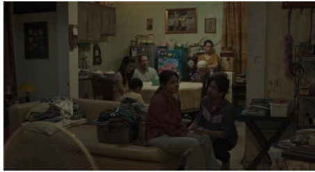
Setting 3. Living room setup

The setting of the family's crowded and messy living room becomes the location for the climax of the family conflict. Kaluna's presence, who possesses significant savings (Rp 330 million), positions her as a capital owner and the family's economic savior. Kaluna's refusal to pay her brother's debt is an affirmation of the boundary of personal ownership resulting from her hard work (Achieved Status) against the demands of kinship (Kanendra's Ascribed Status). This proves that the highest social status in this context is held by the one who works hard, surpassing gender or age hierarchy.