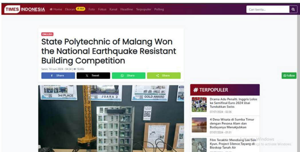
Figure 3. TIMES Indonesia news article comparison with the title "Salura Island: The Untouched Hidden Gem of East Sumba"

The comparison results revealed a clear and significant disparity in the viewer counts of two articles: one by the researcher, "State Polytechnic of Malang Won the National Earthquake Resistant Building Competition," and another by TIMES Indonesia, "Salura Island: The Untouched Hidden Gem of East Sumba." The article by the researcher had 18.460 views, whereas the TIMES Indonesia article had 16.500 views. The results suggested that the researcher's articles, especially those focused on education, specifically vocational education can compete and achieve good performance in the "English" channel.