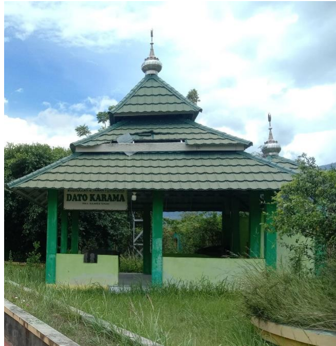
Mosque Datokarama