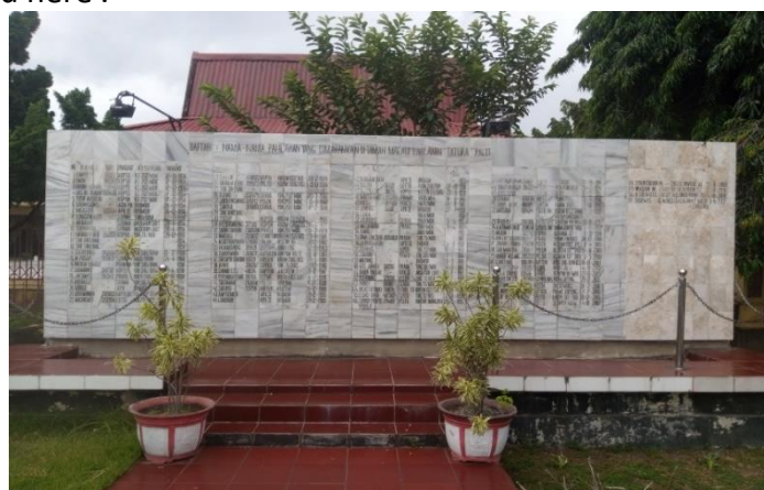
Personal Photo Source: 2023 Eternal walls

In the front area park grave hero this is also available House or the previous room as place burial or place preparation, however father Abd. Kamal say that Now room burial This Already made transit space for inspector ceremony wait moment will prepare activity ceremony in the garden grave hero. In park grave hero this is also available wall eternal which is walls that have been written down with What is the name heroes who have been buried here .