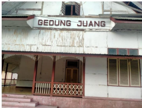
Personal Photo 2023, Juang Building