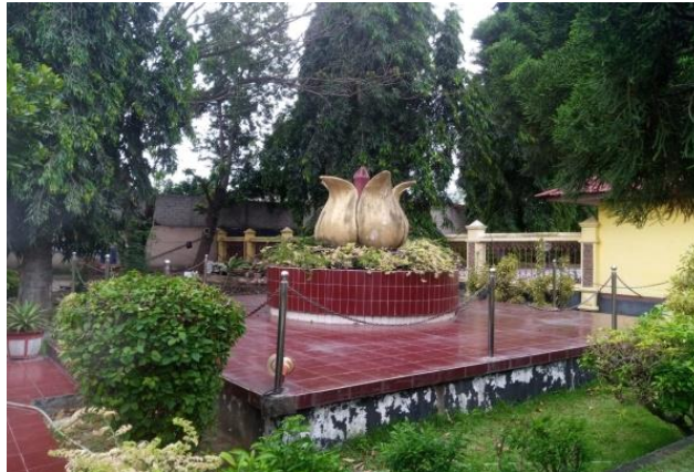
Lotus Statue which is located in the courtyard of the Heroes' Cemetery