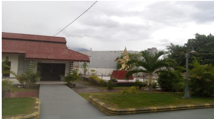
transit places for inspectors

Transit House or place inspector ceremony moment will wait activity ceremony at TMP . When people visit in the park grave hero This they must do respect moreover first in the section area in park grave hero This right in front graves of heroes. Tribute This done For honoring the heroes who have been fought and have precede us. By because That respect this really needs to be done .