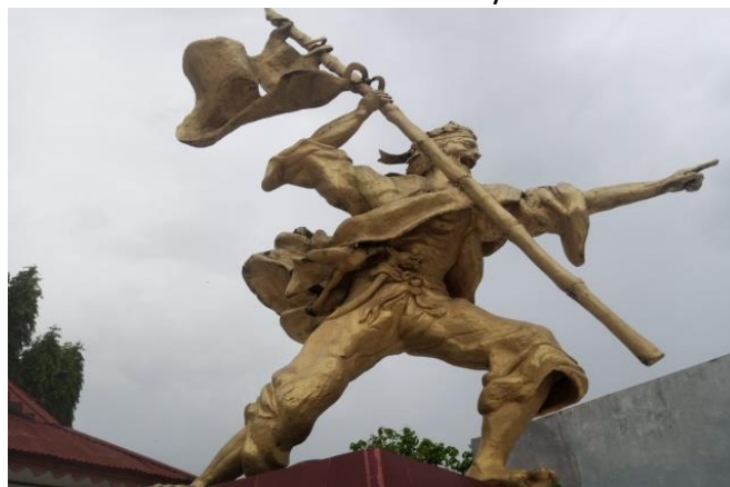
2023 Personal Photo Source: Sculpture A Medium hero fight

In the front area park grave hero this is also available House or the previous room as place burial or place preparation, however father Abd. Kamal say that Now room burial This Already made transit space for inspector ceremony wait moment will prepare activity ceremony in the garden grave hero. In park grave hero this is also available wall eternal which is walls that have been written down with What is the name heroes who have been buried here .