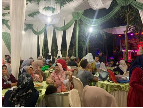
Figure 6. Gathered together when badantam

Koentjaraningrat (1990, p. 366) says that the closest social union is a kinship union, namely the closest nuclear family and other relatives. There is also a unity at the time of carrying out the badantam tradition. The unity embodied in social implementation can be seen from the family unit, member associations, community units, both communities in one Korong and Nagari. The unity contained in the badantam tradition symbolizes family and community ties. Unity can overcome differences, where badantam members come from economic differences, ethnic differences and so on.