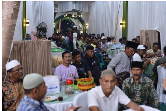
Figure 2: Gather at sipangka's house

The night after the wedding took place, the invited guests and the public gathered at home sipangka to attend and follow the tradition of badantam . When gathering at home sipangka all the devices and the host who held the wedding agreed to start the badantam event.