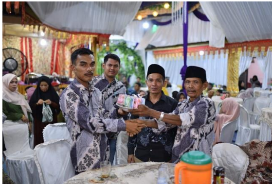
Figure 5: Submission of funds to sipangka