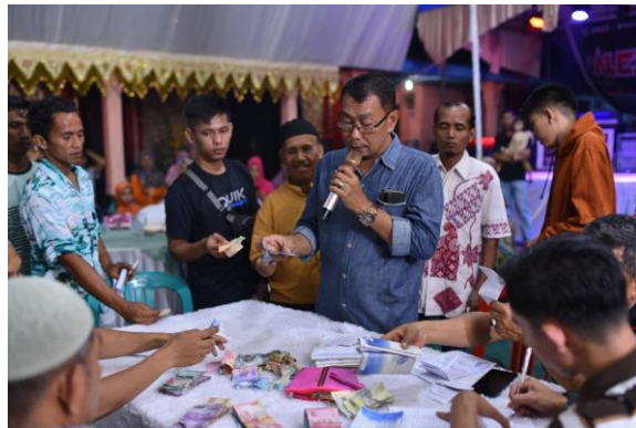
Figure 4: The form of the implementation of the badantam tradition

The nominal value of the money given has been determined, that is, if the woman is getting married, she is required to make a contribution of Rp. 35.000,- and if the person who is getting married is the male party, the minimum nominal value is Rp. 25,000, but if someone exceeds it, they will be happy to accept. Giving money at the time for badantam in Korong Koto Rajo Nagari Sunur Tengah begins with aleh lungguak (main family). If aleh lungguak has finished providing funds, it will continue with the provision of financial assistance from the Korong community. After all the funds have been collected, the amount will be calculated. After knowing the total money received, tukang sorak will announce or notify the public and ask thanks for their participation in helping sipangka .