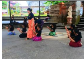
FIGURE 1. 6 Art Studio and Training Studio