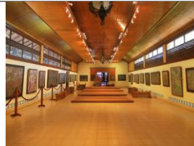
FIGURE 1. 4 Mahudara Exhibition Hall