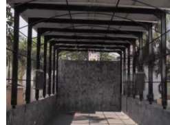
FIGURE 1. 14 Amphitheater