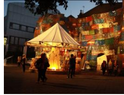
FIGURE 1. 13 open spaces & Outdoor stage