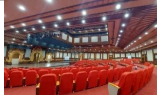
FIGURE 1. 3 Ksirarnawa Building