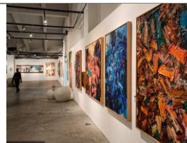
FIGURE 1. 12 gallery and workshop exhibition spaces

Exhibition Spaces / Galleries & Workshops