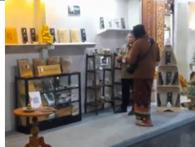
FIGURE 1. 5 Commercial area and art stalls