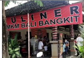
FIGURE 1. 8 Culinary Area & MSMES