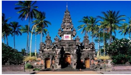
FIGURE 1. 1 Bali Art Center

Bali Cultural Park / Bali Art Center is one of the favorite places for tourists. Taman Budaya Bali / Bali Art Centre is located on Jalan Nusa Indah, Denpasar. It is a large complex area, which is \pm 14 hectares, for the original cultural art performances of the Bali Art Centre. The architecture of the Bali Cultural Park / Bali Art Centre is designed based on the architecture of temples and the Kingdom of Bali (Tourism and Culture Office of the Province of Bali, 2019).