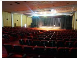
FIGURE 1. 11 Concert Hall

Exhibition Spaces / Galleries & Workshops