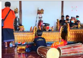
FIGURE 1. 7 Mini Museum & Art Gallery