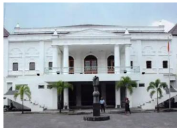
FIGURE 1. 10 Cultural Park of Yogyakarta

Yogyakarta Cultural Park (TBY) is an art and cultural facility that functions as a center for the preservation, development, and appreciation of culture in the Special Region of Yogyakarta. TBY accommodates various traditional and contemporary art activities, such as performances, exhibitions, festivals, and art education activities, so that it acts as a space for interaction between artists, the community, and the local government. With a contextual design approach to local culture and the urban environment, TBY becomes an active, inclusive, and relevant integrated cultural arts area as an object of comparative study in the planning of arts and culture centers (Rusyanti & Sukmawati, 2020; Sutrisno, 2019).