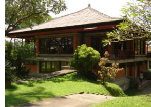
FIGURE 1. 9