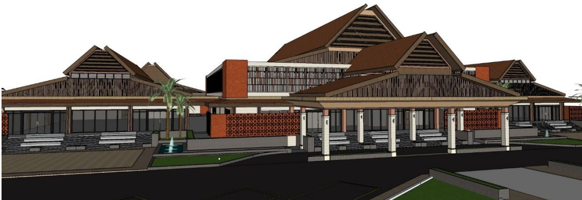
FIGURE 1. 15 Architectural design of arts and culture facilities in Banyuwangi

Core Concept: “Banyuwangi Cultural Centre”