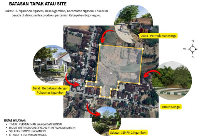
Figure 2: Selected Site or Location, and Site Boundaries