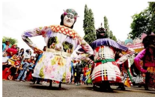
Figure 5 . Ta'butaan Jember is a traditional musical