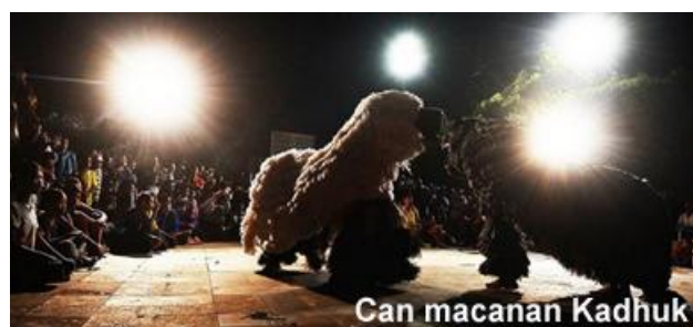
Figure 3 . Can Macanan Kadduk

Can-Macanan Kadduk is a traditional performance whose name originates from the Madurese language and can be translated as “sack tiger.” Historically, this performance was presented as part of village thanksgiving ceremonies or communal rituals. Over time, however, Can-Macanan Kadduk has evolved into a form of public