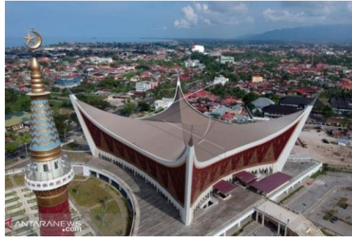
Figure 9 . West Sumatra Grand Mosque

West Sumatra Grand Mosque is considered one of the most prominent examples of Neo Vernacular Architecture in Indonesia. Instead of using a conventional dome, the design reinterprets the gonjong roof form of the traditional Rumah Gadang , which represents the cultural identity of the Minangkabau people. The dynamic curved roof structure, the incorporation of Minangkabau songket motifs on the façade, and the adaptation of cultural patterns in a modern architectural expression strongly reflect Neo Vernacular principles. The building illustrates how local cultural identity can be expressed through contemporary architectural design while preserving its symbolic and cultural significance.(Imamuddin & Isnaniah, 2024)