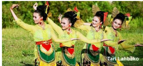
Figure 4 . Lahbako Dance