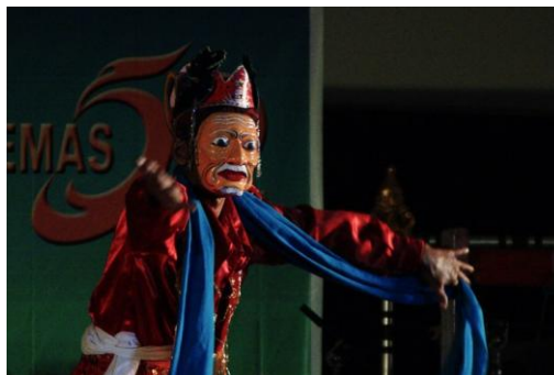
Figure 1 . Lenggèr Dance