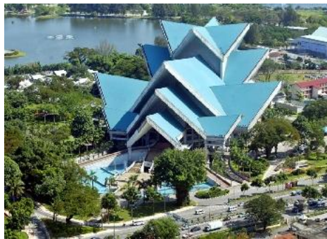
Figure 8 . National Theater Of Malaysia

Istana Budaya is the national performing arts center of Malaysia and is widely recognized for its application of Neo Vernacular Architecture. The building adopts elements from traditional Malay architecture, particularly the concept of the Rumah Melayu , which is reinterpreted within a modern architectural composition. The roof design is inspired by the form of sirih junjung , a symbolic arrangement in Malay culture, while traditional Malay patterns and motifs are incorporated into the façade and interior through the use of contemporary materials and construction technologies. This approach demonstrates how local cultural elements can be transformed into a new architectural identity without directly replicating traditional forms. Both the interior and exterior spaces combine cultural aesthetics with the functional requirements of a modern performing arts venue, reflecting Neo Vernacular principles that emphasize continuity between traditional values and contemporary architectural needs. (Rahim & Abdullah, 2024)