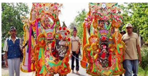
Figure 2 . Jaran Kencak Traditional Art

Jaran Kencak remains a popular traditional performance among the Pandalungan community, particularly in Jember Regency and Lumajang Regency in East Java. This art form continues to thrive in both regions and is characterized by a trained horse performing rhythmic movements that resemble dancing. During the performance, the horse moves in coordinated steps following the rhythm of traditional music, creating an engaging cultural attraction for the local community.