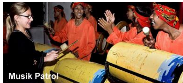
Figure 6 . Patrol music

Patrol music is one of the cultural arts that has become an important cultural asset of Jember Regency. This musical performance presents a distinctive and appealing harmony of melodies that attract audiences. The characteristic sound is produced by wooden tube instruments of various sizes, which are combined with musical instruments such as flutes to create a unique musical composition. The songs performed in Patrol music usually include regional songs from Javanese, Madurese, and Banyuwangi traditions, reflecting the cultural diversity of the region.