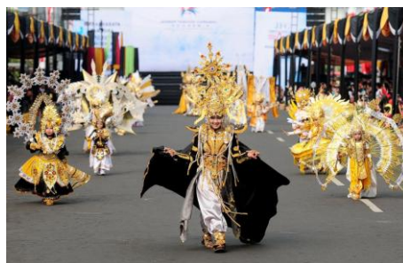
Figure 7 . Jember Fashion Carnaval

Jember Fashion Carnaval (JFC) is a contemporary performing art event presented in the form of a large-scale carnival or parade. Visually, it showcases creative