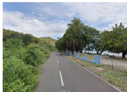
Figure 3: Activity Condition of Alternative Site 1

Alternative Site 1 is located on the edge of a forest, making the site conditions very quiet and relatively isolated. be reached in about 4 minutes.