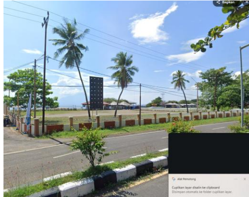
Figure 12: Utilities of Alternative Site 2

The utility conditions at Site 2 are very good, as the area is already served by an electricity network, making the beach well-lit at night. In addition, a municipal water supply (PDAM) system is available in this area due to its location in the city center.