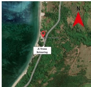
Figure 5: Accessibility of Alternative Site 1

The site has very good accessibility, as it is located along the main road, namely Jl. Trans Balauring.