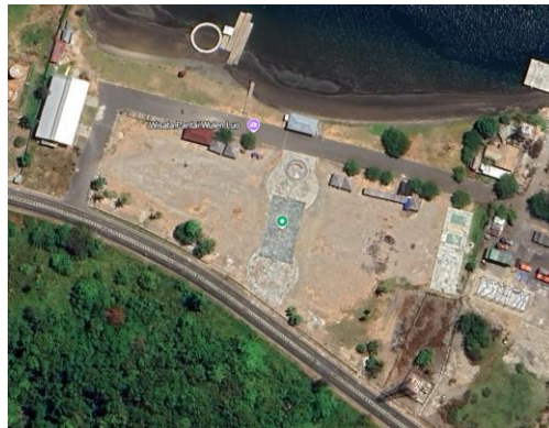
Figure 7: Alternative Site 2

Wulen Luo Beach Tourism Area is located on Jl. Trans Lembata, North Lewoleba, Nubatukan District, Lembata Regency, East Nusa Tenggara. This beach is situated in the center of Lewoleba City, allowing visitors to access it at any time—morning, afternoon, evening, or night. The beach is located near Lewoleba Port, enabling visitors to enjoy sea views while watching ships passing through the waters. In addition, within the site there is a road approximately 10 meters wide, which is used by visitors for jogging, as the entire stretch is free from vehicle traffic.