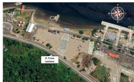
Figure 11: Accessibility of Alternative Site 2

The site has very good accessibility, as it is located along the main road, namely Jl. Trans Lembata.