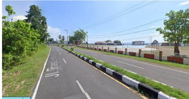
Figure 9: Activity Condition of Alternative Site 2

Alternative Site 2 is located along the Trans Balauring Road, which is directly connected to the city center from the western area. In addition, this road also provides direct access to the seaport, making Alternative Site 2 relatively busy and active.