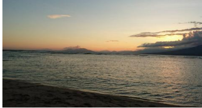
Figure 4: Attraction of Alternative Site 1

The first site features white sand, and in the afternoon, visitors can enjoy the sunset. This gives Site 1 a fairly strong visual and experiential appeal.