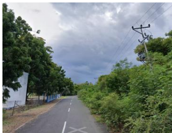
Figure 6: Utilities of Alternative Site 1

The utility conditions at Site 1 are fairly good, as the area is already served by an electricity line. However, electricity has not yet been distributed within the site, causing the beach to appear dark in the late afternoon and evening. The water supply at the site still relies on a bore well, which is stored in a reservoir tank and then distributed to bathrooms or toilet facilities.