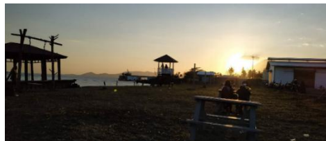
Figure 10: Attraction of Alternative Site 2

This beach is located near Lewoleba Seaport, allowing visitors to enjoy sea views while watching ships passing through the waters. This creates a unique attraction for visitors.