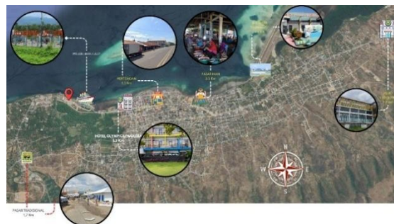
Figure 8: Supporting Facilities of Alternative Site 2

The alternative Site 2 is located in the city center, making it easier and faster for visitors to access supporting facilities available in the urban area.