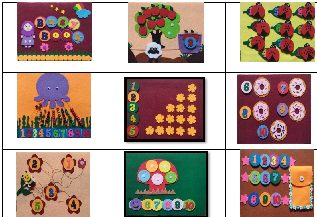
Final Model Busy Book

The final product developed in this study is a Busy Book learning media designed to improve early childhood numeracy skills. The Busy Book consists of 1 cover page and 8 content pages , each measuring 23 cm × 27 cm . The final page includes a pocket containing 20 colorful congklak seeds as counting aids.